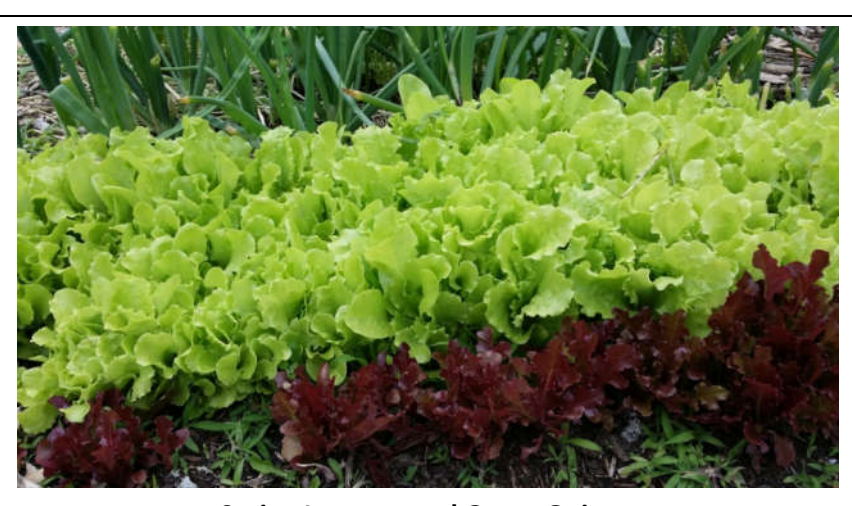
Spring Lettuces and Green Onions