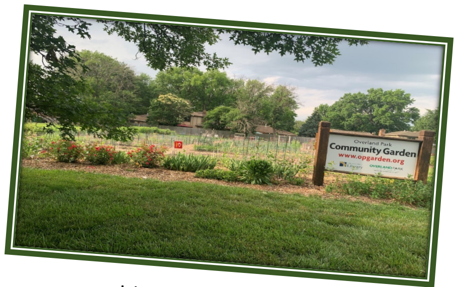
Late spring, the garden emerges.