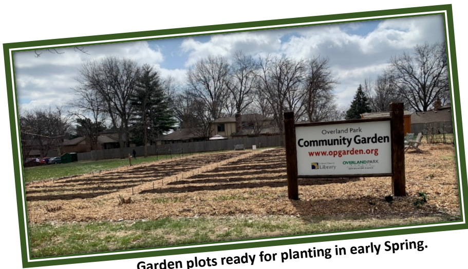
Garden plots ready for planting in early Spring.

To plant a garden is to believe in tomorrow